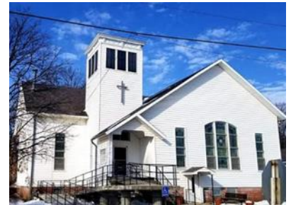
Table Rock UMC 9:00 a.m. Worship 10:15 a.m. Sunday School Wednesday 9:30 a.m. Bible Study

Humboldt UMC 10:45 a.m. Worship Wednesday 8:00 a.m. Bible Study