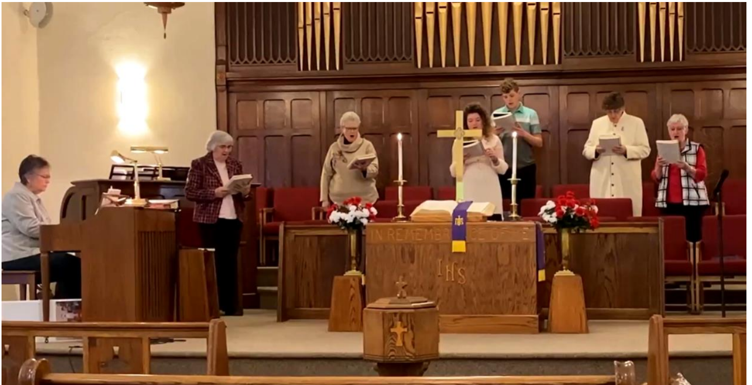
Celebrating some live music during worship again.